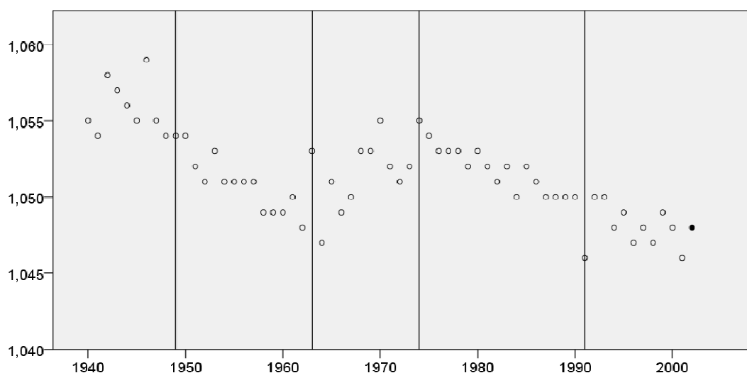
Figure 1: Sex odds at birth in the U.S. 1940-2002